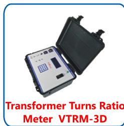
Transformer Turns Ratio Meter VTRM-3D