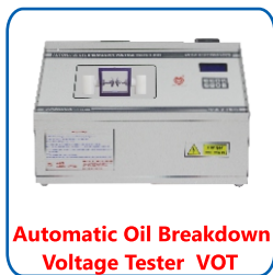
Automatic Oil Breakdown Voltage Tester VOT