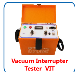
Vacuum Interrupter Tester VIT