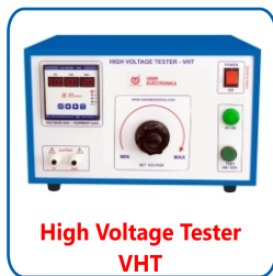
High Voltage Tester VHT