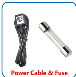
Power Cable & Fuse