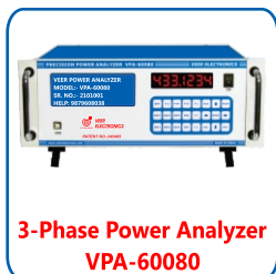
3-Phase Power Analyzer VPA-60080