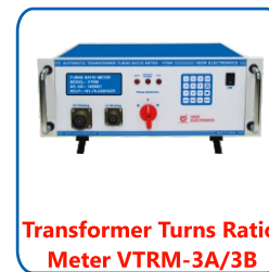
Transformer Turns Ratio Meter VTRM-3A/3B