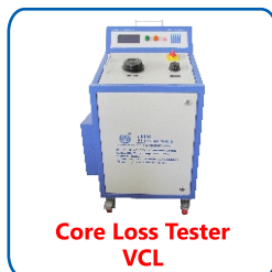
Core Loss Tester VCL