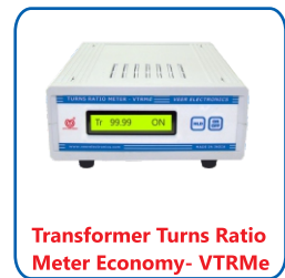
Transformer Turns Ratio Meter Economy- VTRME