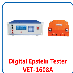
Digital Epstein Tester VET-1608A