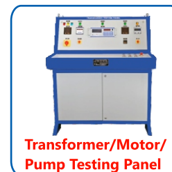
Transformer/Motor/Pump Testing Panel