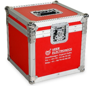
Holiday Detector VHD