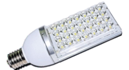
LED lights Manufacturer